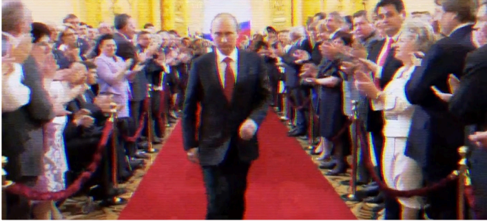
Vladimir Putin's over-the-top inauguration in the Grand Kremlin Palace in Moscow, fit for a Czar