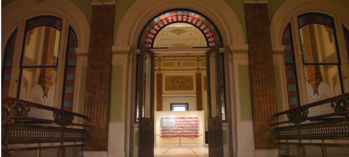
Entrance to the Great Hall at the Smithsonian National Portrait Gallery, Washington D.C.