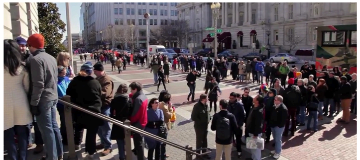
Thousands line up outside the Smithsonian National Portrait Gallery to view David Datuna's exhibition