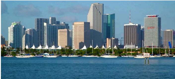
Looking over Biscayne Bay to the Downtown Miami skyline