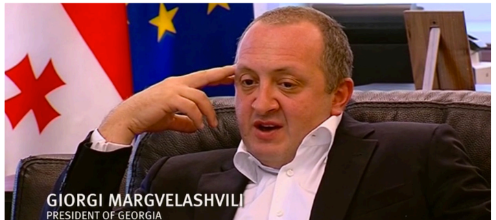
GIORGI MARGVELASHVILI PRESIDENT OF GEORGIA